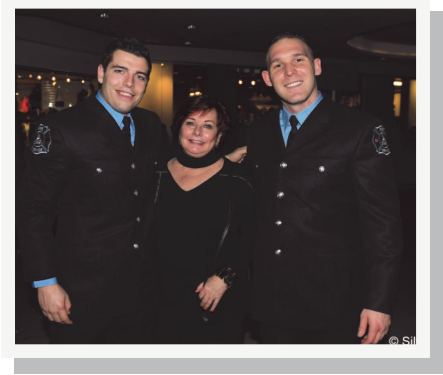
IGNITE A DREAM