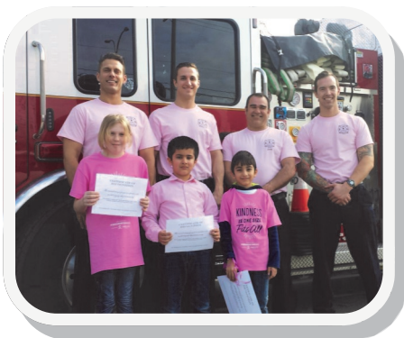
PINK SHIRT DAY