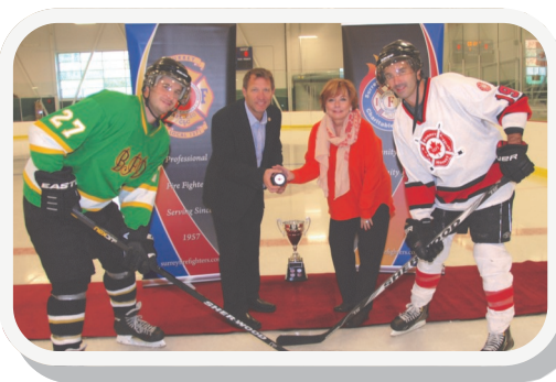
HOCKEY FOR MENTAL HEALTH