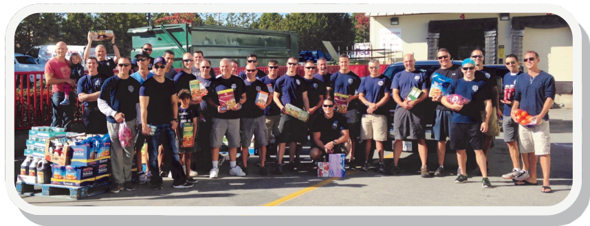
NUTRITIONAL SNACK PROGRAM