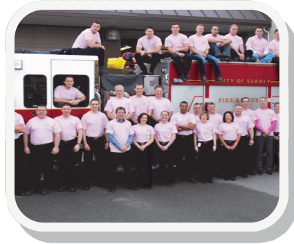
PINK SHIRT DAY